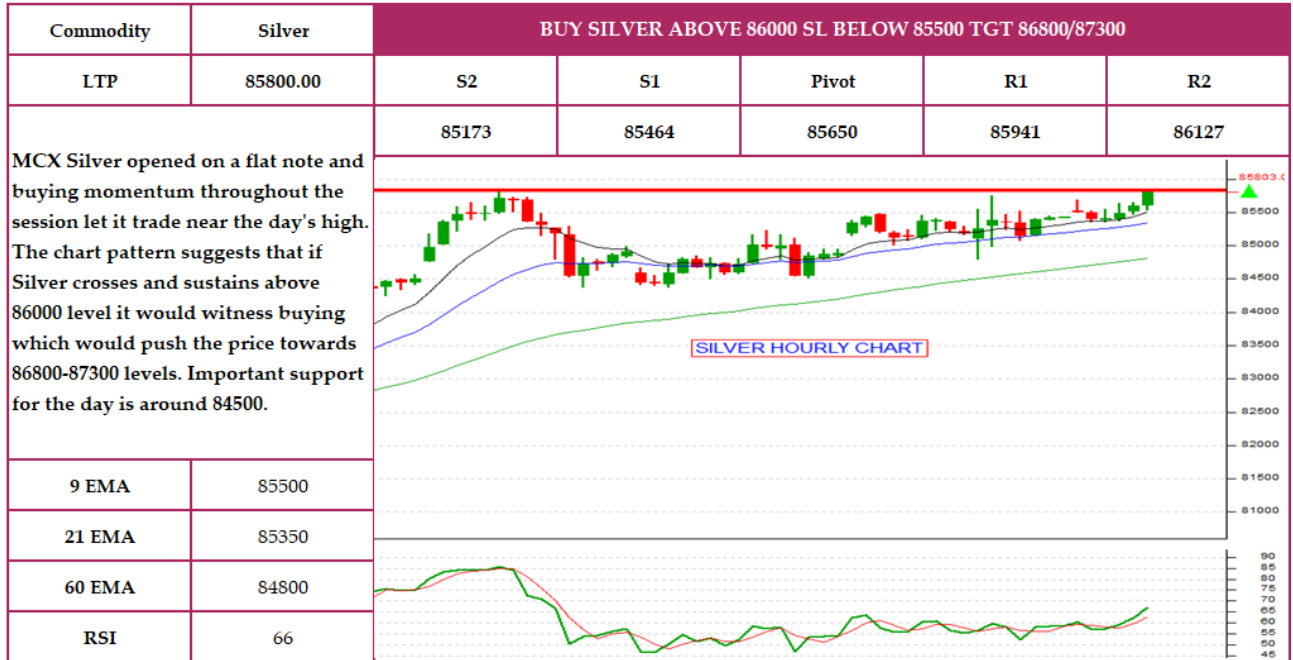
Chart for the day